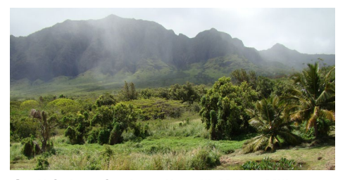
4. U.S. Army Garrison–Hawai'i: Makua Military Reservation, Schofield Barracks, Kahuku Training Area, Poamoho Training Area, O'ahu REPI Funds: $2.7M