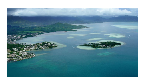
Pacific Missile Range Facility Barking Sands, Marine Corps Base Hawai'i, P\u00f6hakuloa Training Area, Kaua'i, O'ahu, Hawai'i Island REPI Funds: $3.1M